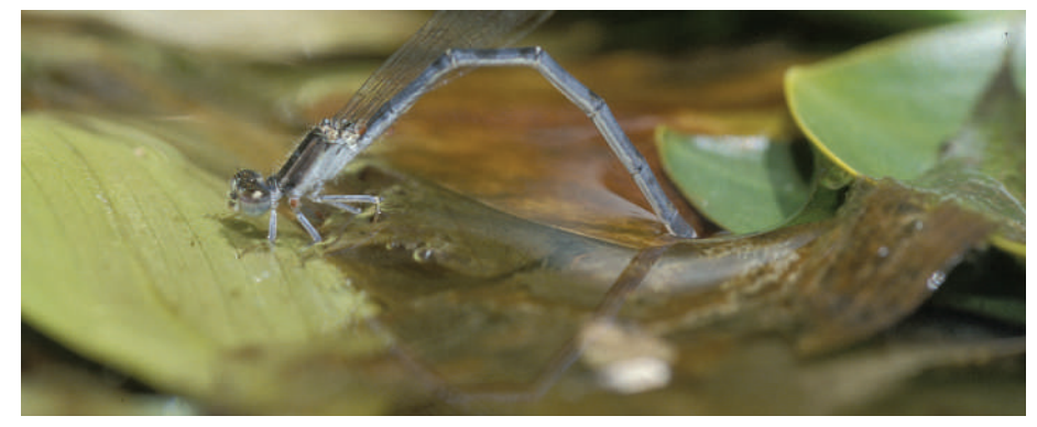
Figure 1 | Reproduction without fertilization in a damselfly. A female Ischnura hastata lays eggs in a pond on the island of Pico, Azores.

The Azores archipelago lies 1,500 km from the coast of Europe. Inspired by a report<sup>4</sup> that only females of the damselfly Ischnura hastata had ever been found there, Cordero Rivera and his team visited 15 localities on six of the islands. Although more than 330 adult specimens of I. hastata were examined, none of them was male. To test whether the species